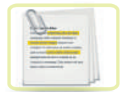
Mock Exams & Practice Papers