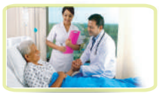
Communication Skills & How to Tackle