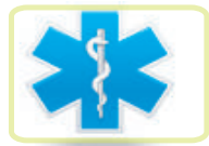
Clinical & Written Courses

REGISTRATION FEE 2,500 AED Fully Paid of 10th of August 2,300 AED